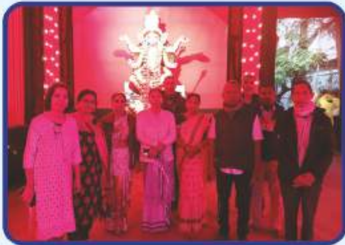
Celebration of Kali Puja