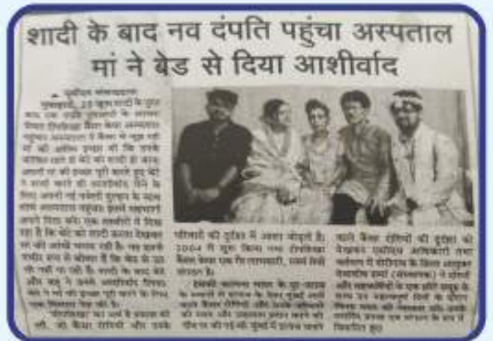
Ailing mother blessing the newly weds in our centre