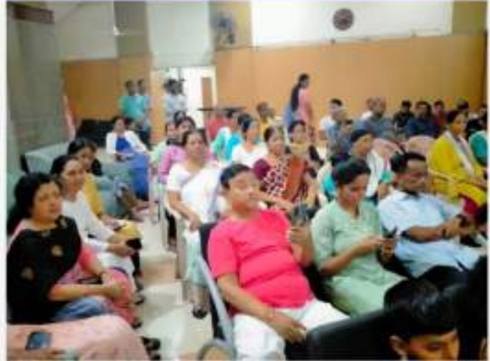
Diwali Nite celebration