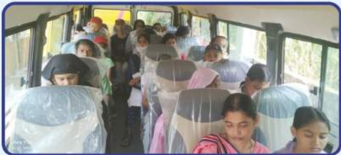
Donation of a 20 seater Traveler by SBI MF