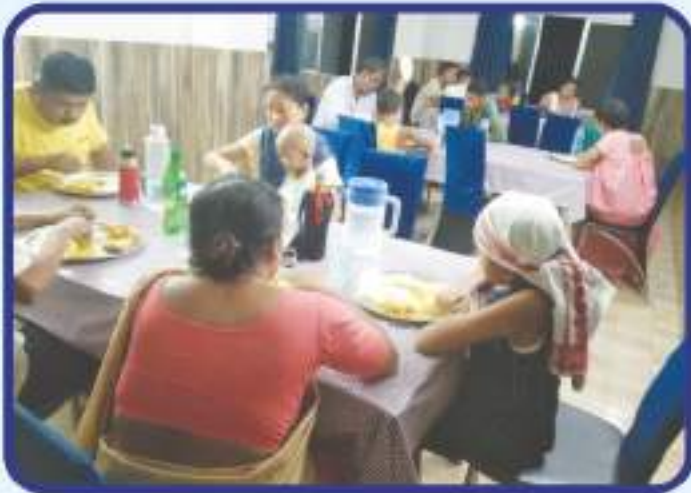
Children having dinner