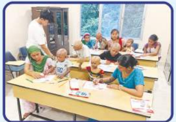
We Can ... We Will