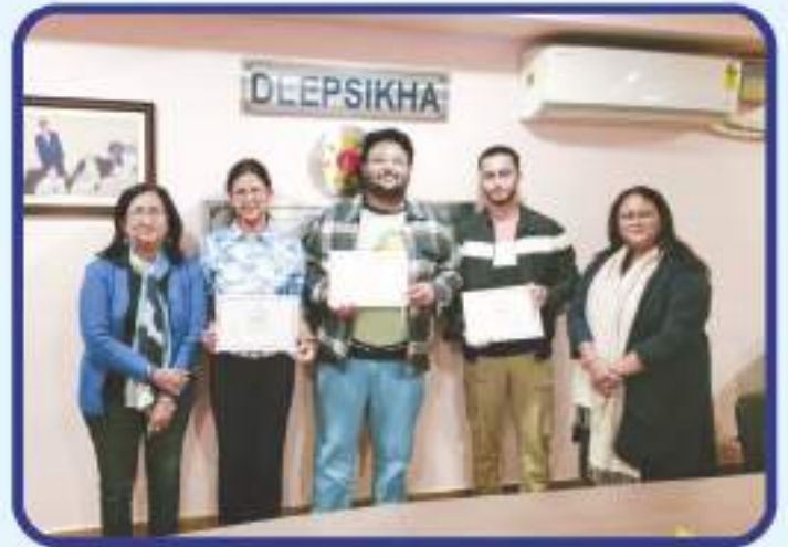
Interns from different Institutes