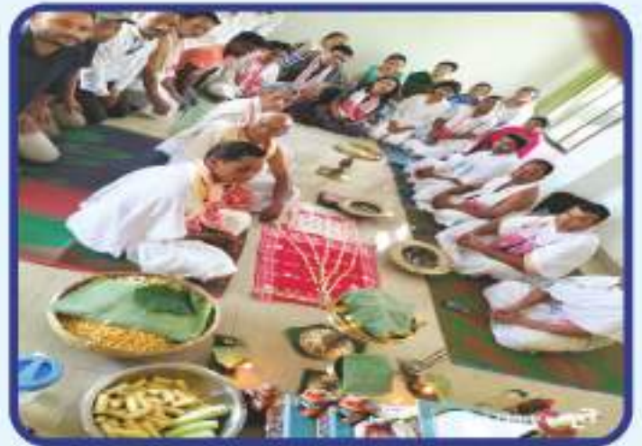
Prayers for wellbeing & happiness