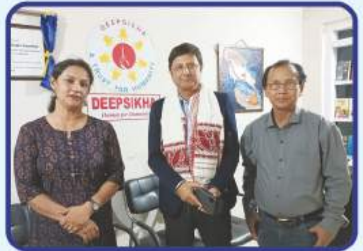
Visit to our Dibrugarh centre by our chairman