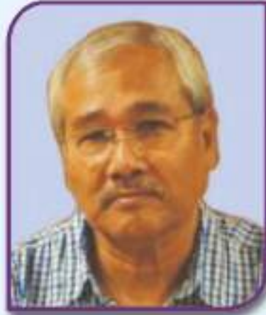
Padma Bhushan Awardee Shri Jahnu Barua Chief Patron