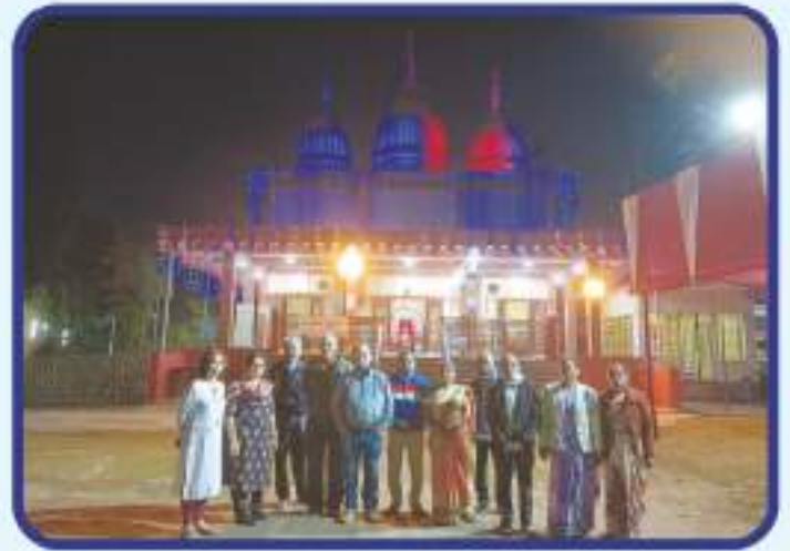
Diwali in our Dibrugarh centre