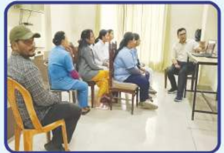
Motivational talk to our Hospice staff