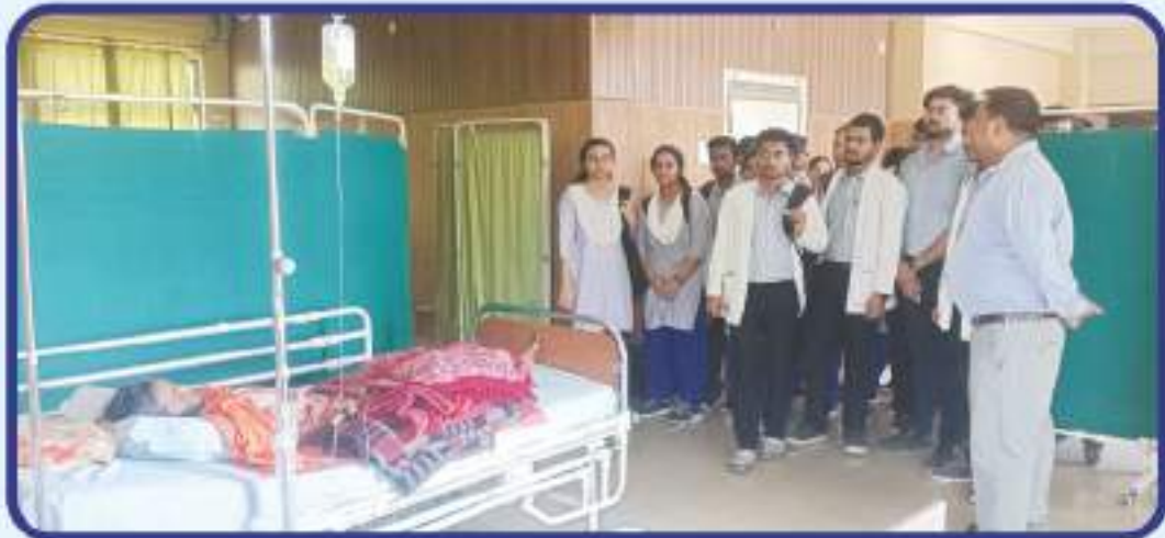
Visit of 4 th Semesters MBBS students from GMCH