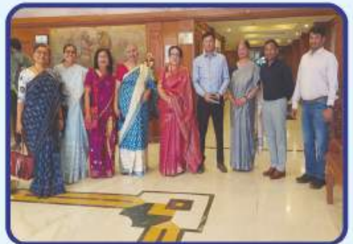
President of CACI with members