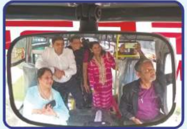
Donation of a bus for cancer patient's by Rotary Club of Bombay Metropolitan