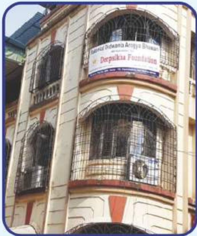
Ratanlal Didwania Arogya Bhawan

Plot No.RH-1/M-52, Sector-7, Vashi, Navi Mumbai