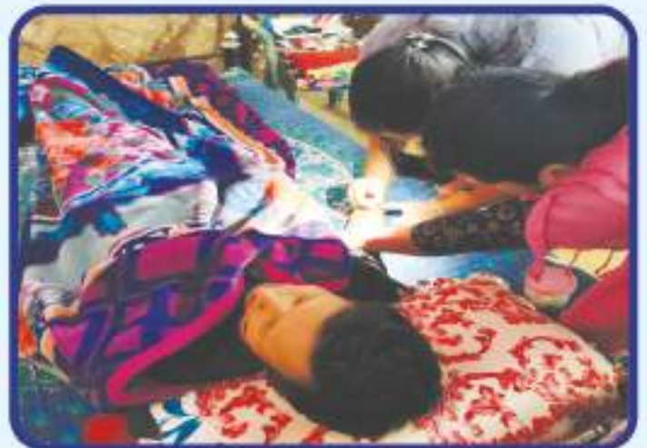
Our home care service