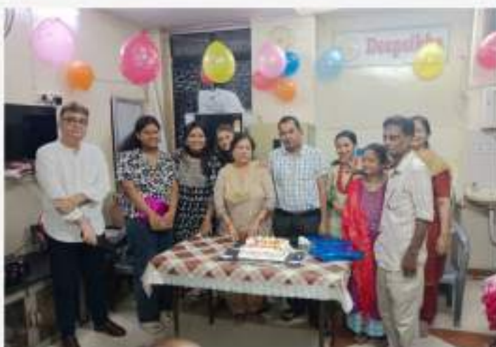
Monthly Birthday celebrations at our Sadbhav Arogya Bhawan.