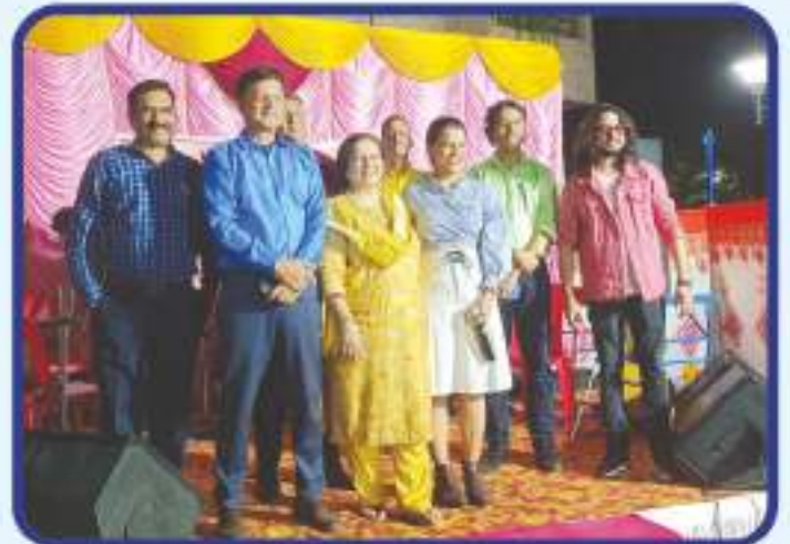
Patients enjoying Diwali... May this divine festival bring Peace, Joy and Happiness