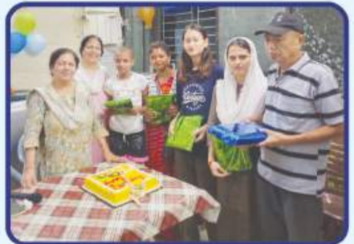
Celebrating life amidst challenges