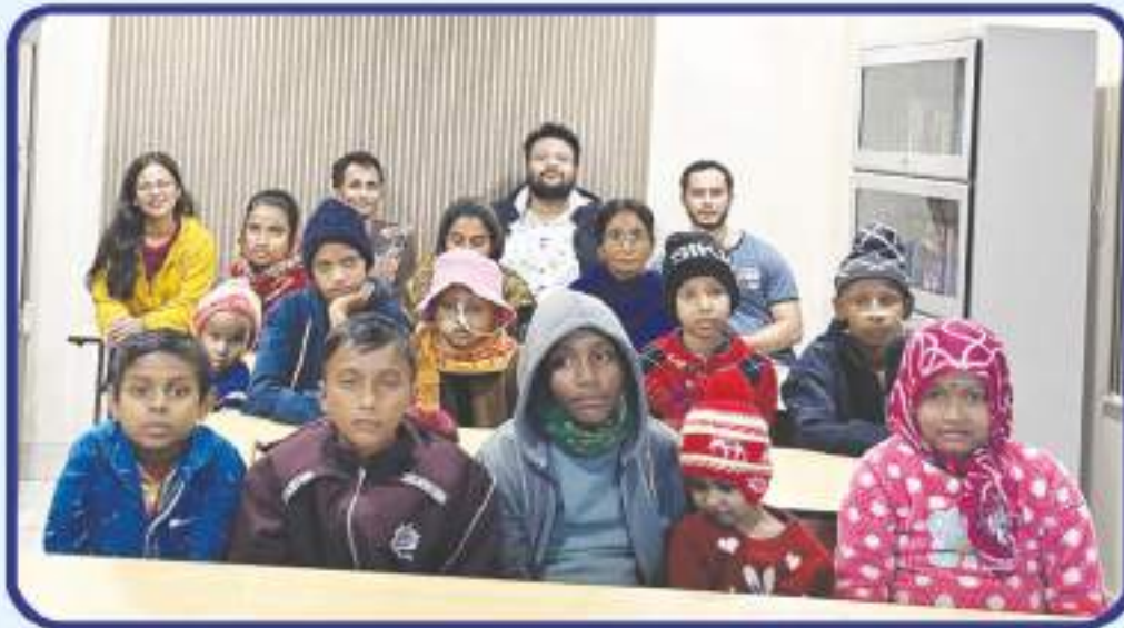
Interns with our children