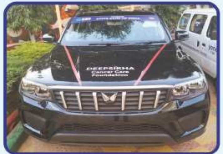
Donation of a Scorpio NZ by State Bank of India