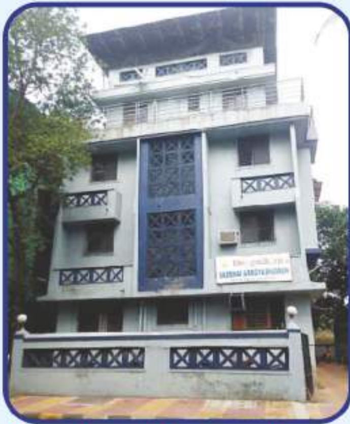
Deepsikha's Sadbhav Arogya Bhawan

Plot No.202, Sector-28, Vashi, Navi Mumbai