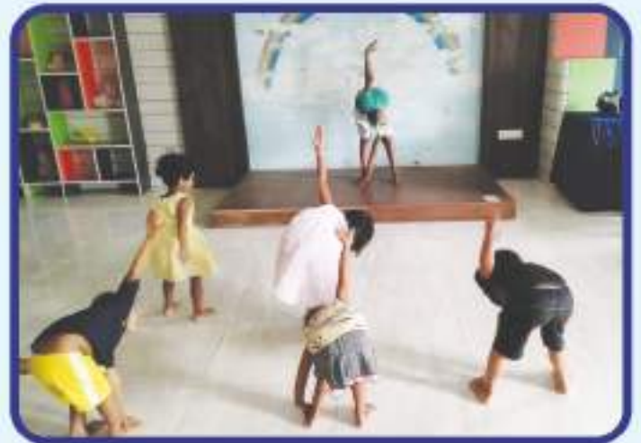
Our activity room