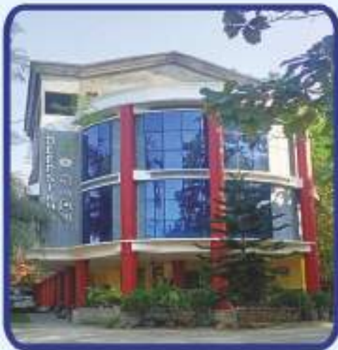
Front view of our hospice