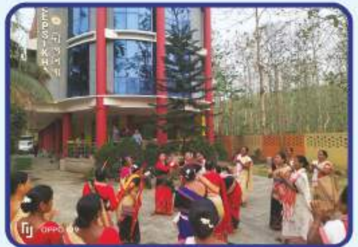
Bihu dance by the local community in our Hospice