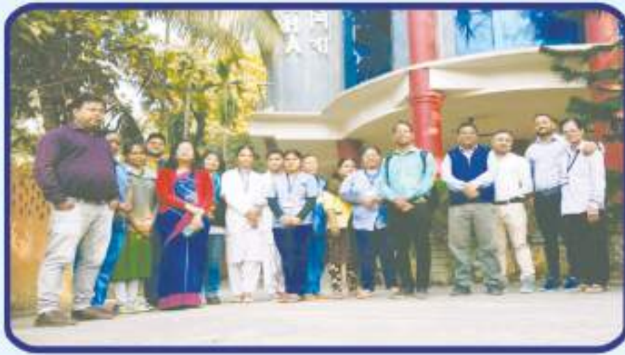
Visit by friends of Deepsikha