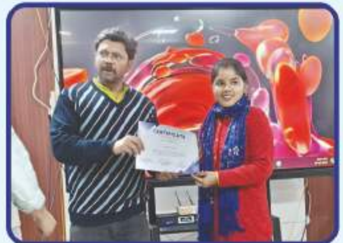
Certificate awarded to our staff members on the completion of a training on Palliative Care by State Cancer Institute