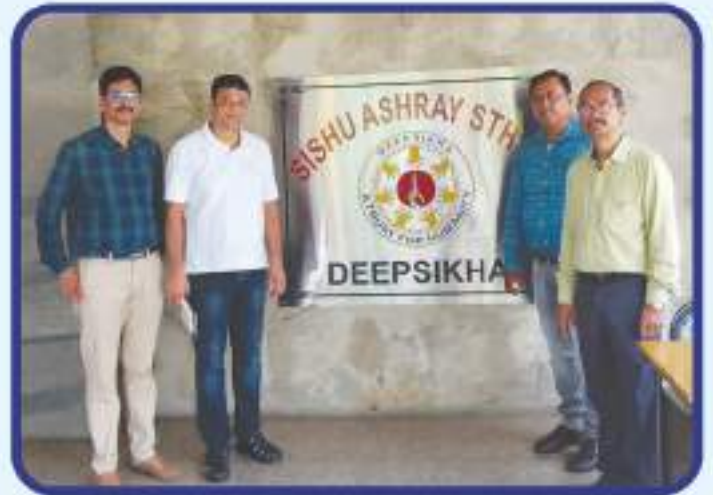
Visit of higher officials of LICl