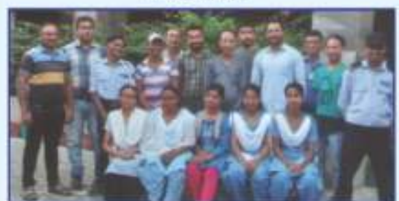
Shishu Ashray Sthal Staff