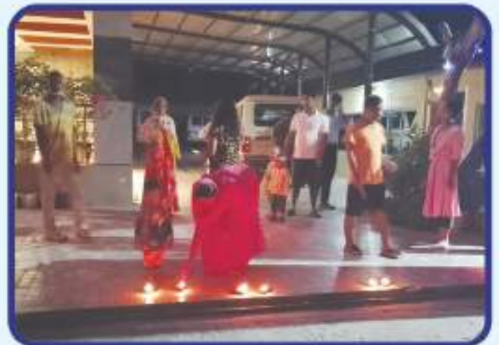
The festival of light was celebrated with fun & enthusiasm