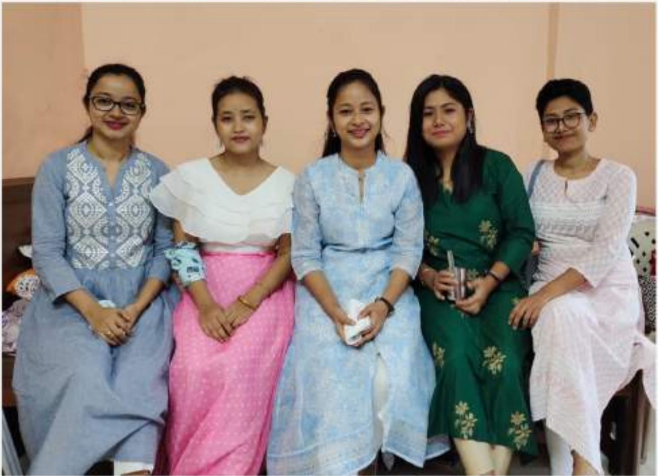
Patients and their caretakers

"Nothing can dampen the spirits and positive aura of our young lovely ladies.."