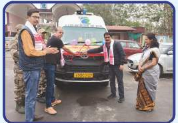
Donation of an Ambulance in Dibrugarh by BCPL