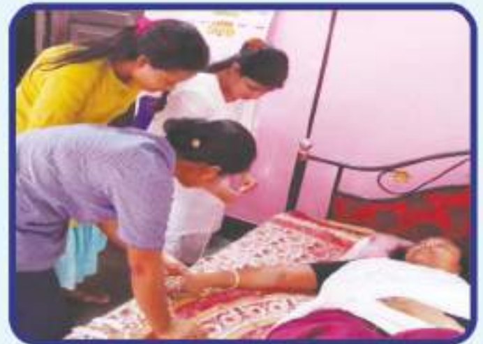
Our staff providing care to patients