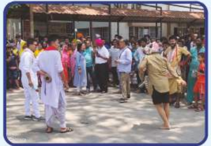
Street play on World No Tobacco Day